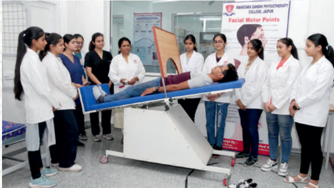
MGH Physiotherapy Labs