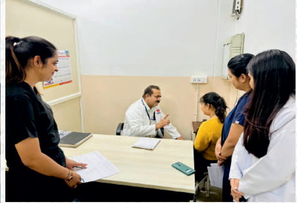
MGH Physiotherapy OPD